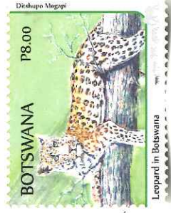
LEOPARD Panthera pardus Nkwe (Setswana)

"Among the causes of decline of lion populations, the most important are indiscriminate killing in defence of human life and livestock, habitat loss, and prey base depletion. Prey base depletion is partly linked to habitat loss, but more importantly to poaching and bushmeat trade. An emerging threat is trade in bones and other body parts for traditional medicine, both within Africa and in Asia. While attention is currently focused on Lion hunting reforms to ensure sustainability, the leading causes of population decline are more difficult to address and are likely to continue."