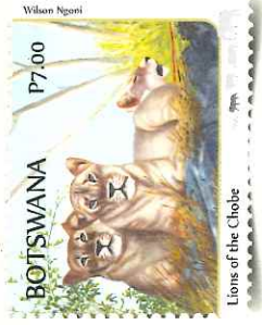
LION Panthera leo Tau (Setswana)

Although the White ( Ceratotherium simum ) or Square-lipped Rhinos numbers exceed those of the Black, the species faces the same threats as the Black Rhino. Botswana's Law enforcement agencies continue to step up protective measures to safe-guard the White and Black Rhino against Horn Poaching.