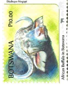
African/Cape BUFFALO Syncerus caffer Nare (Setswana)

Southern Africa likely has the healthiest Leopard populations of their entire range. Botswana has a continuous Leopard population in the North and West."