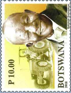
P10.00 Stamp: THE FARMER and POLITICAL DIGNITARY

In 1980, after the passing on of Botswana's first President, Sir Seretse Khama, the then-Vice-President, Ketumile Masire, became Botswana's second President. He continued to build upon the Four National Principles, which the young country was founded on: Democracy, Development, Unity and National Self-reliance . He was committed to entrenching democratic ideals in Botswana and Africa as a whole. During his presidency, Masire received an honorary knighthood of the Grand Cross of Saint Michael and Saint George in 1991.