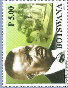
P5.00 Stamp: THE EDUCATOR

The stamp depicts the youthful former President in his prime as a teacher before becoming part of the emerging political elite in the Bechuanaland Protectorate.