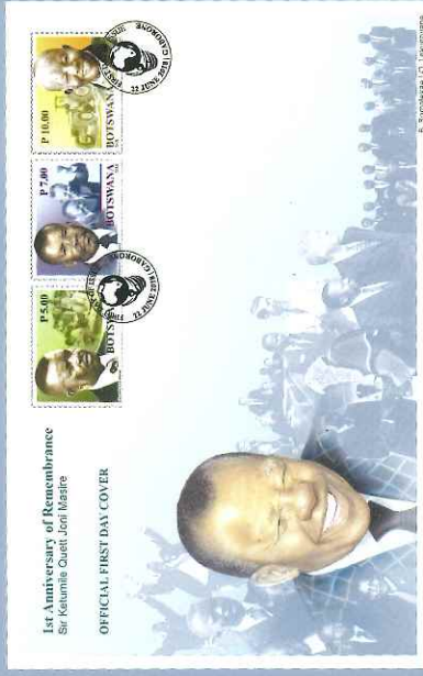
Official First Day Cover

Many lessons from farming would later shape his contributions to politics, especially the agro-pastoral and land tenure reforms. Thus, President Masire was instrumental in the introduction of the Tribal Land Act in 1968, the Land Boards in 1970, the Tribal Grazing Land Policy in 1975, the Arable Land Development Programme in 1979, the Arable Rainfed Programme in 1983, the National Policy on Agricultural Development in 1990, and many others.