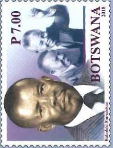
P7.00 Stamp: THE NATION'S LEADER

In 1948, he was appointed acting-headmaster of Kanye Junior Secondary School, later called Seepapitso Senior Secondary School, a school established by the Bangwaketse Tribal School Committee.